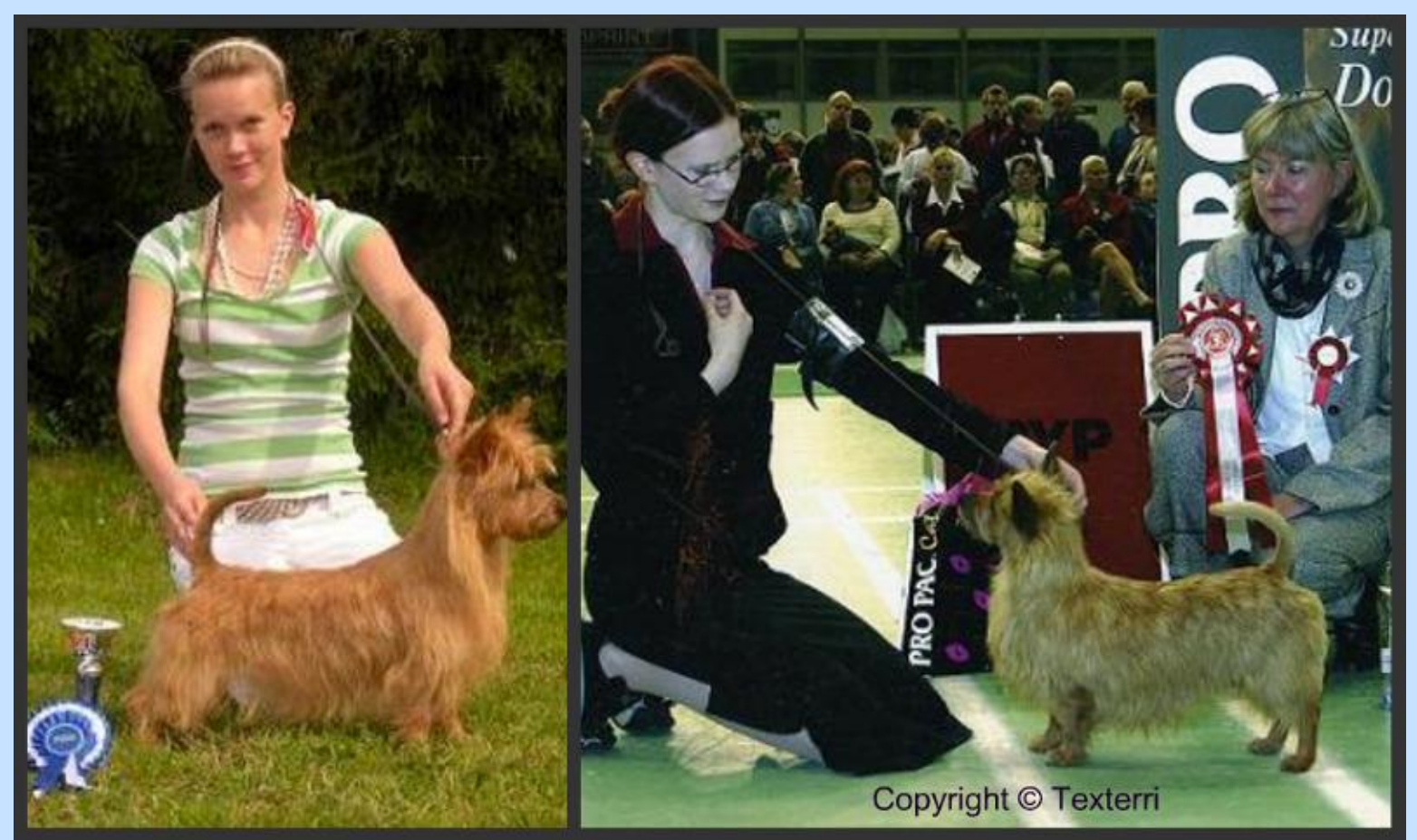
"Puhti" CH Surely Sexbomb to BOB

my friends) that is the main interest and so it will be.