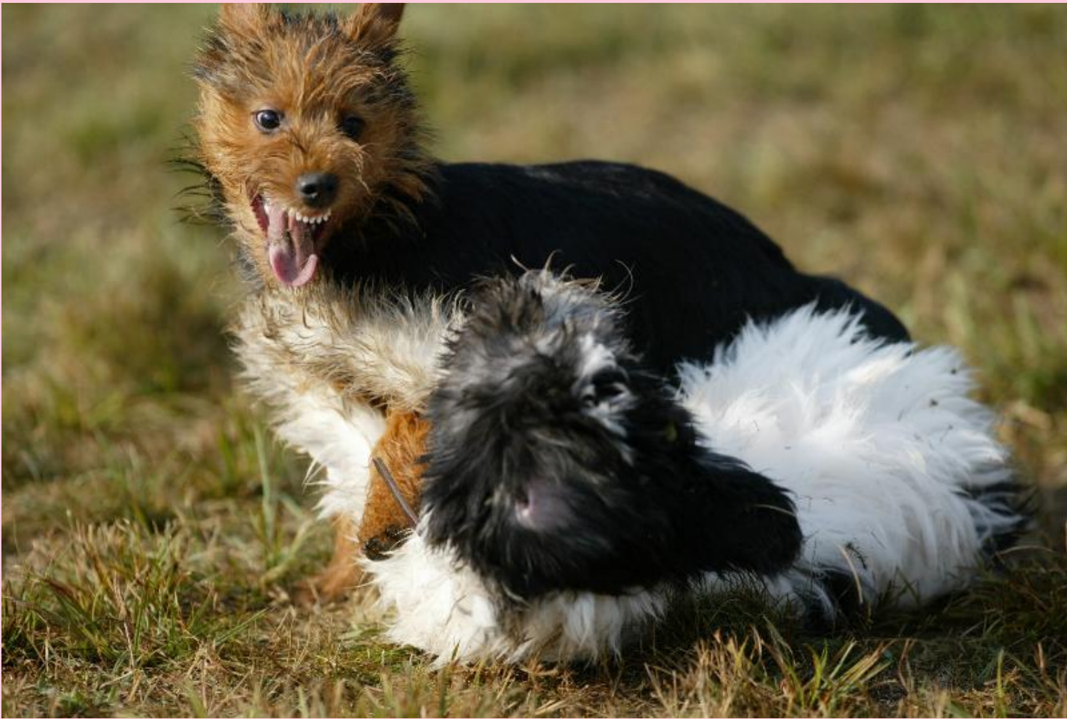
"Alfie and Zeta at Camp Gone To The Dogs"