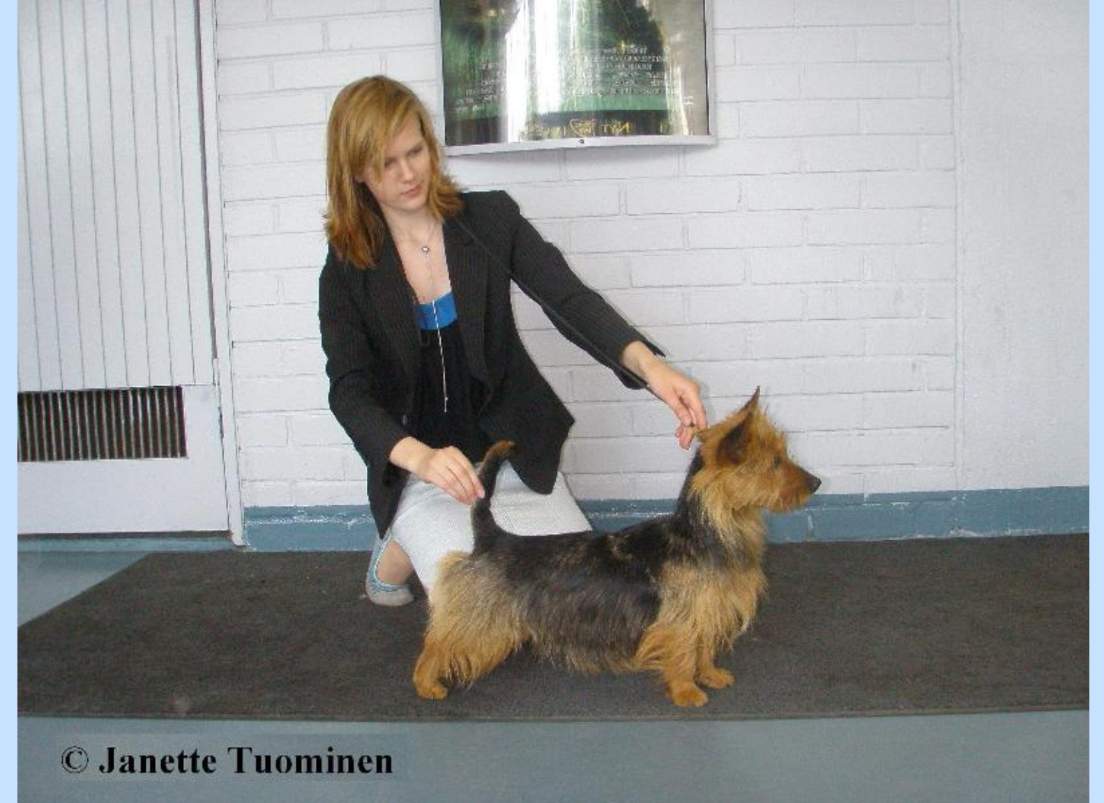
"Milli" CH Surely Mad About You