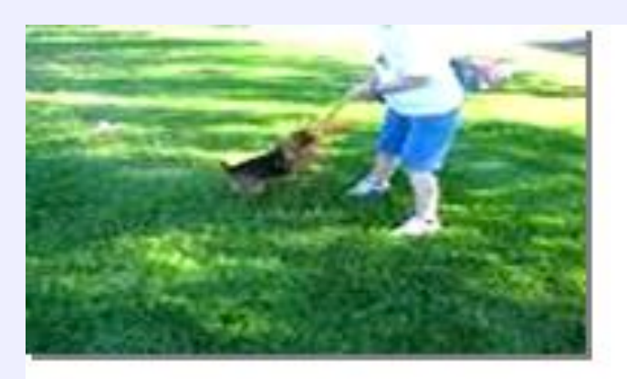
Reward your dog when they do something well. Tug is a big reward for Wally.

Another form of jackpot is a special game or extended playtime. Break off training and immediately begin to play with the dog for a longer than usual period of time or use both treats and play.