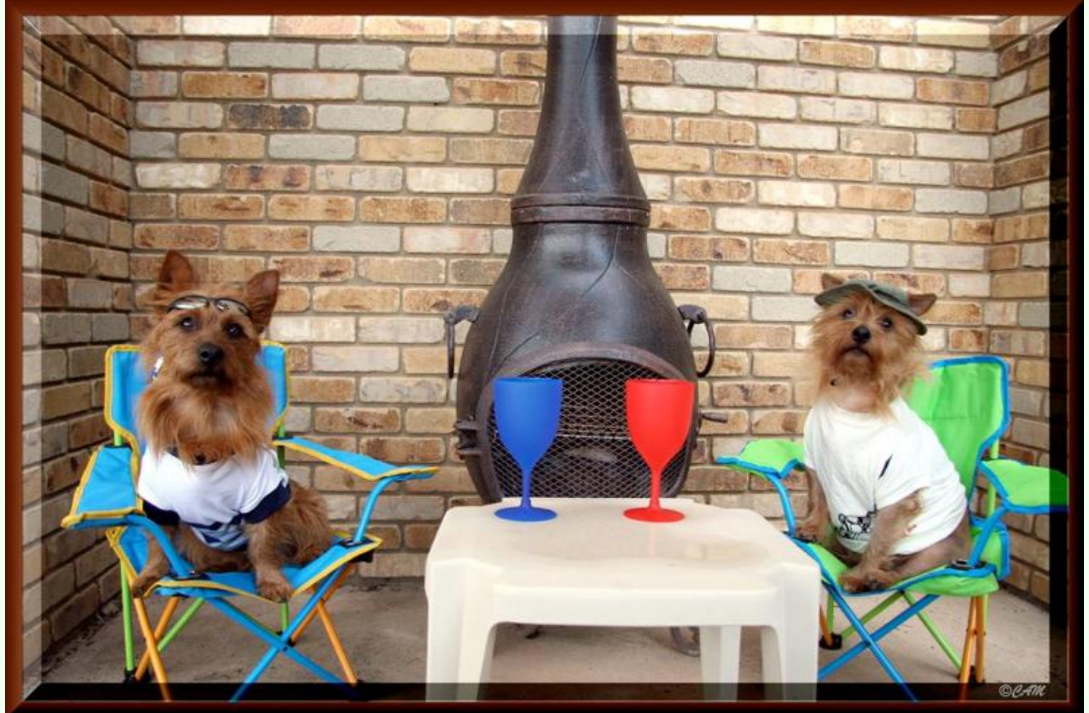
The Mechalke's Wish All Father's A Fabulous Day!