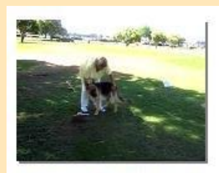
Photo L Do not push your dog into a sk. Don't even tap them on the bottom or put them into the sit. The dog doesn't have to sit at the start. You really don't want to man-handle the dog into position.

Speak up; don't nod your head. Most judges are watching the dog and your feet, not your head at this point, as they are ready to score you as you move out so they may not see your nod.