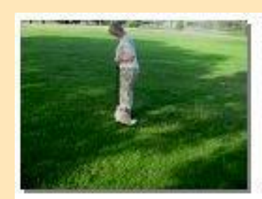
location and gets et up This honor stay.

Get into the honor position quickly and quietly so you don't disrupt the next dog on the line. More detailed information about performing the honor will be given under the discussion of the Honor station, sign #50.