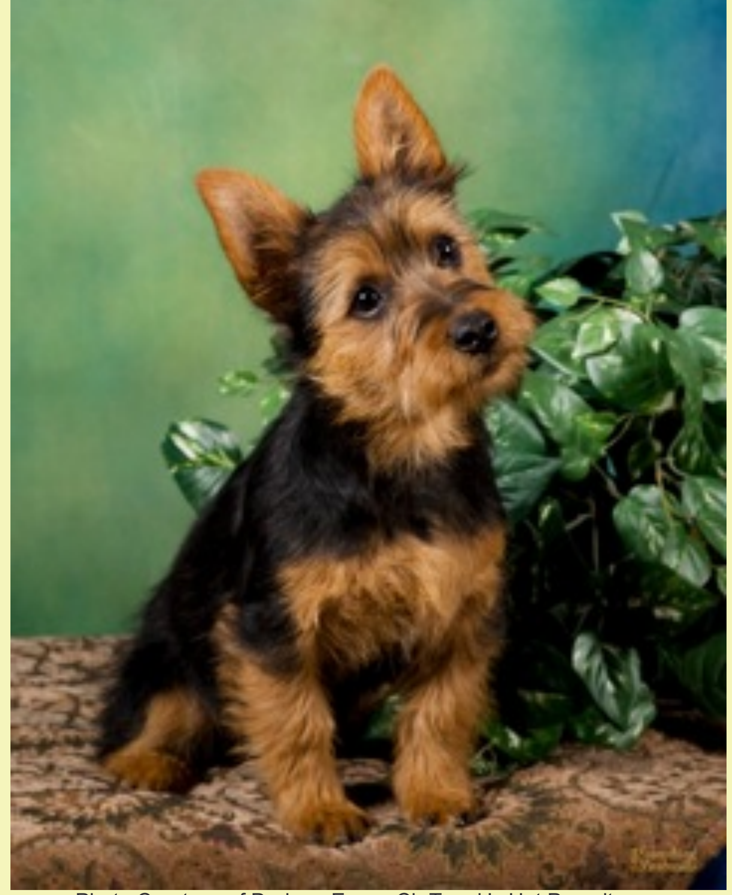
Ch Tera-k's Hot Pursuit Ch Ryba's Super Trouper x Ch Tera-k's Sleigh Bells owned by Chris Tuthill