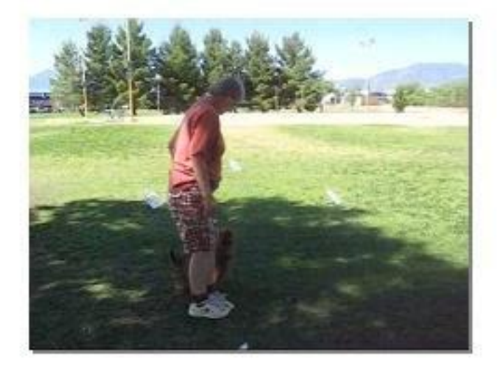
Heel to the start line and set up. You do not have to look at the judge, but you can give your arm band number and dog's breed and jump height as you enter as a double check with the judge's score sheet.