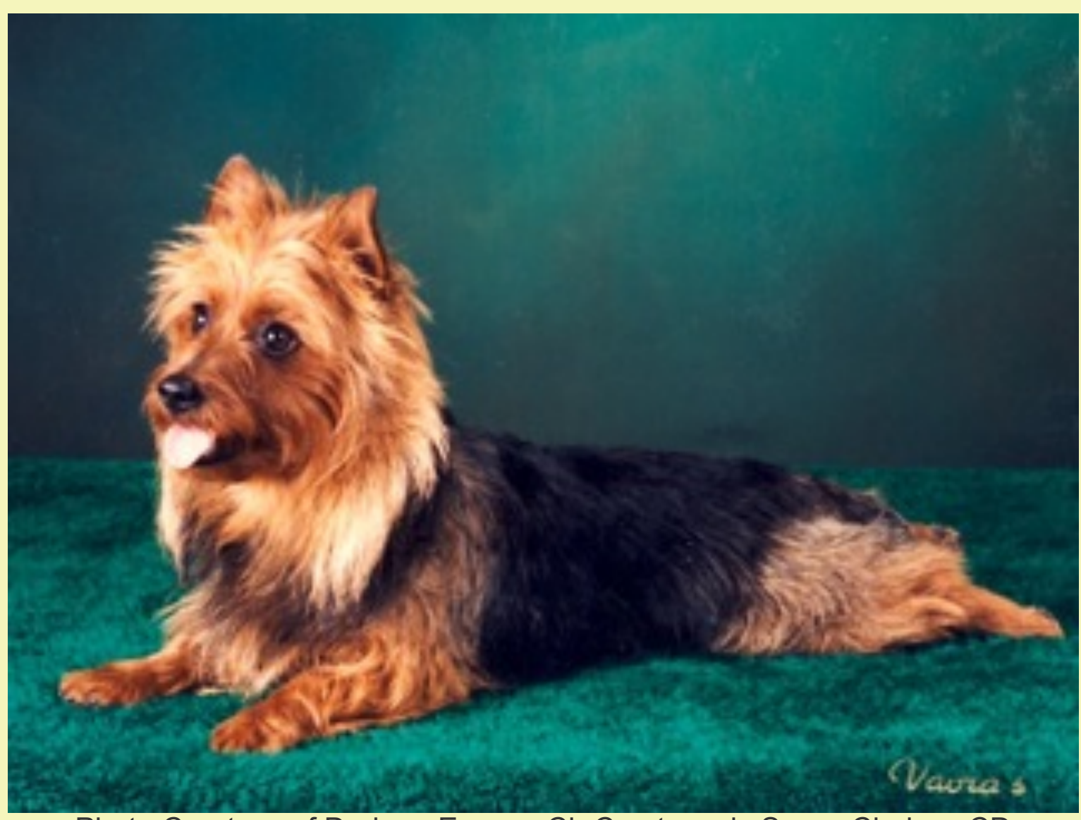
Ch Crestwoods Sassy Chelsey CD Daughter of Crestwoods Crackerjack x Crestwoods Cinderoo