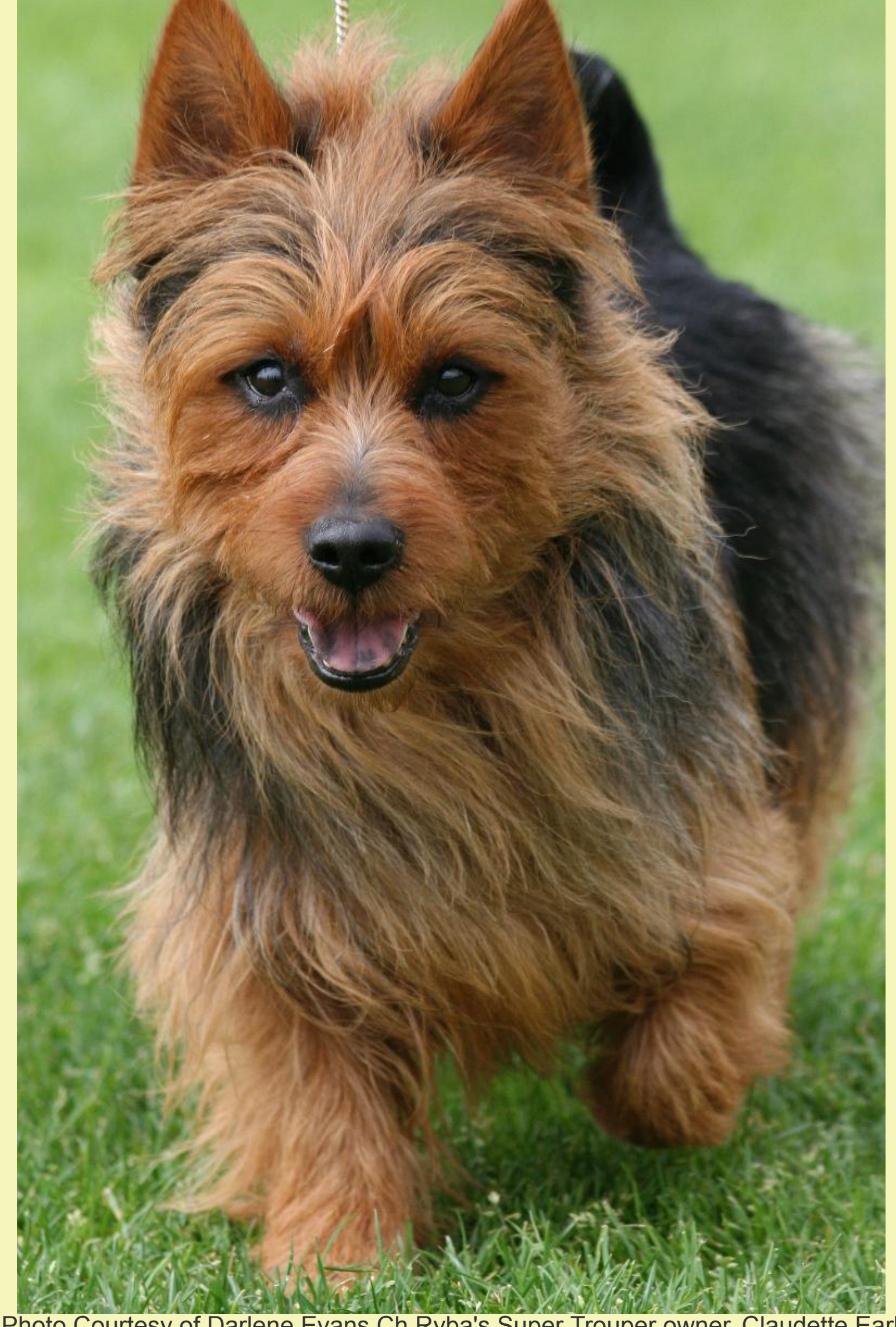
Ch Ryba's Super Trouper owner, Claudette Earl