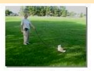
Walk forward to the end of the proceed immediately to the honor give your dogs command/agnal to leash, then turn and face the dog for the duration of the honor.

If the finish is right at the gate, think ahead about how you will get your dog under control and back on leash before leaving the ring. Usually calling the dog's name and telling them "easy" and starting to quietly praise them will help them focus on the handler while you get the leash. If the gate is directly in front of the finish sign you might try turning to the right or left immediately after the finish, then telling the dog to sit to give yourself some "wiggle room" while you get the leash and put it on the dog.