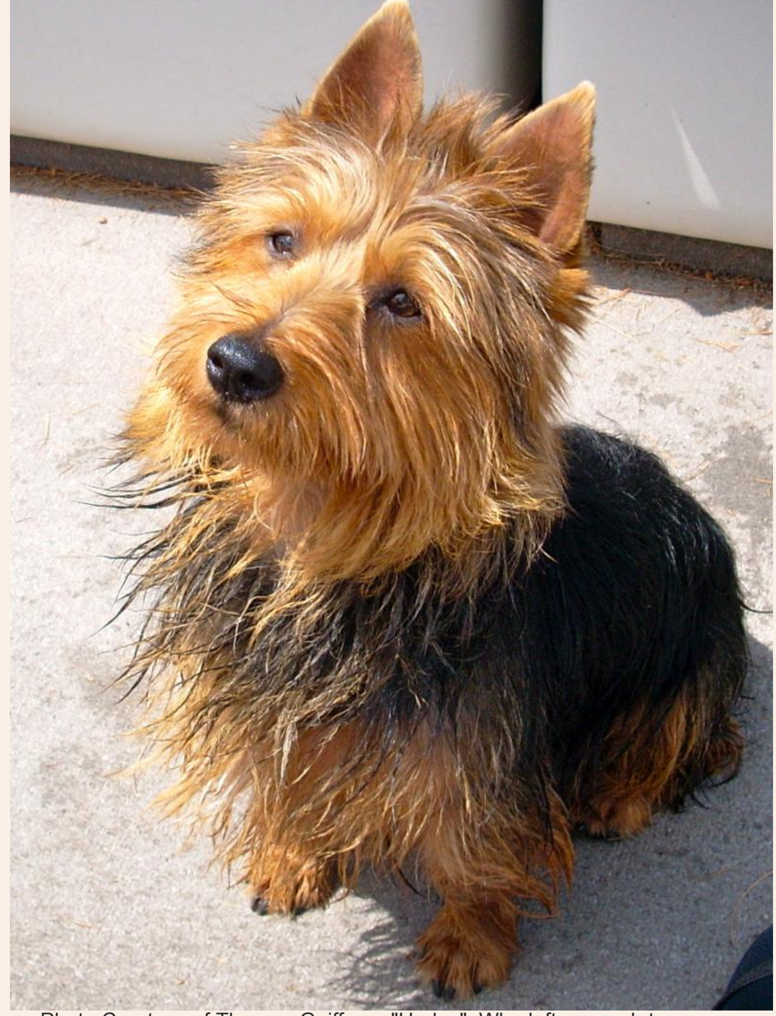
"Harley" Who left us much too soon.

This is a subject our family knew nothing about, until tragically we lost our beloved Australian Terrier, Harley. On July 20, 2009, Harley went down to the lake with my daughter and two of our other dogs, a normal routine in the summer. Harley was just shy of 2 years old, was healthy, happy and loved the water as all our Aussies do. Sadly, he drank lake water that had been toxic from Blue Green Algae blooms. At the time, we weren't aware such a toxin existed, much less would have never thought it would be in a clean, spring feed, and 65 foot deep lake such as Dunham Lake.