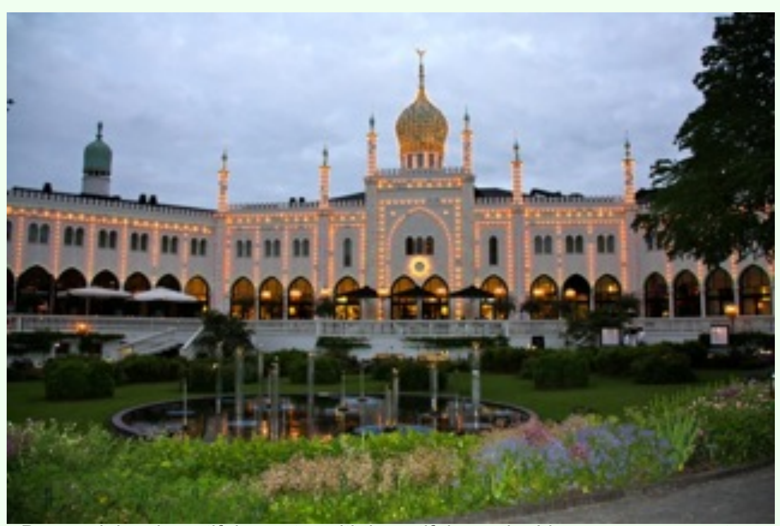
Denmark is a beautiful country with beautiful people. I hope everyone gets a chance to visit one day.